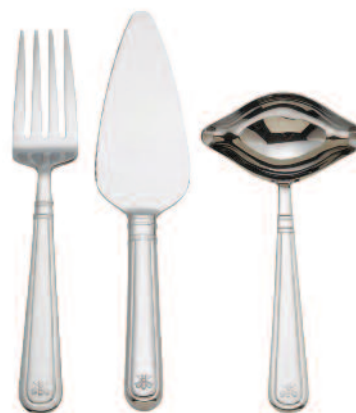
3-Piece Serve Set