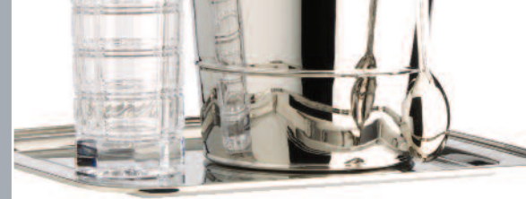
TOB275 Darby Ice Tongs