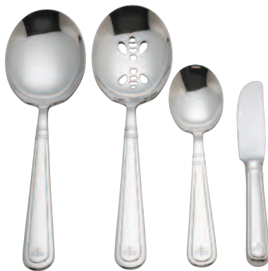
4-Piece Hostess Set