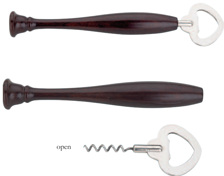
TOB214 Cynthia Bottle Opener

Building on the success of the CYNTHIA™ Collection, Reed & Barton has extended this distinctive cut crystal identity to a mixed-media barware grouping.