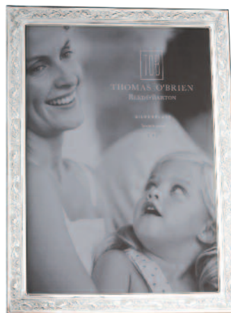
TOB20 – 5 X 7"

The new FLORAL BORDER™ frame faithfully adapts a romantic, scrolling lily engraving from an antique silver frame. The new version shares the rubbed, worn relief of the original silverwork, with background crosshatched etching that gives added depth and patina. Though floral in nature, the design is both subtle and formal enough to please couples as an ideal wedding photo frame. Two standard sizes permit easy photo placement. Both are in silverplate with a lacquered finish to prevent tarnishing.