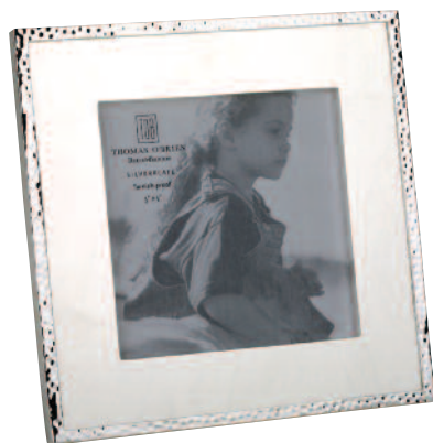
TOB15 – 5 X 7"