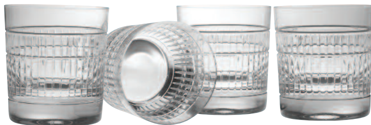
TOB277 Cynthia Hiball – Set/4