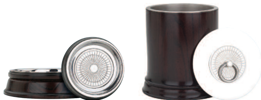
TOB212 Cynthia Ice Bucket