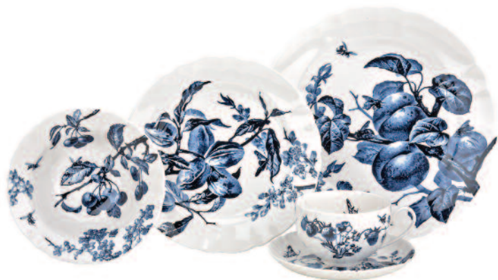
Elegant Casual – Austin Floral Indigo

This fresh botanical pattern is inspired by a 19th century European set of transferware dishes, and it shares the antique's amazing naturalism. A flowing layout that travels across the plate takes its cues from Aesthetic Movement and early Modern china. Multiple motifs of fruiting branches are boldly scaled for a modern feeling; designs include pears, peaches, plums, currants, cherries, strawberries, and blackberries, all dotted with butterflies and bees. Imagery varies from dish to dish, emphasizing a whimsical, one-of-a-kind look.